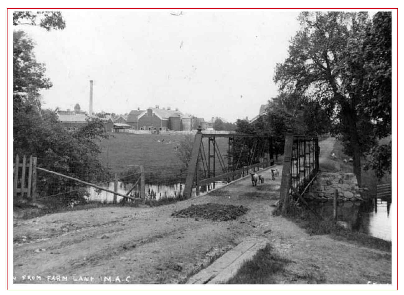
Farm Lane looking North over Red Cedar River Bridge - 1920