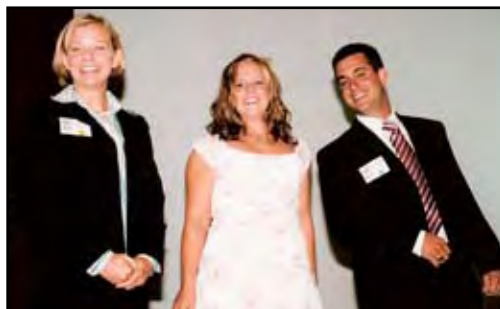
Former scholarship recipients entertained and motivated the audience of potential scholarship recipients about the opportunity MDMSF offers for when they are college students.