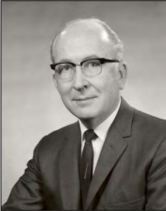
Donald and Valera Murray Michigan Dairy Memorial Endowed Scholarship