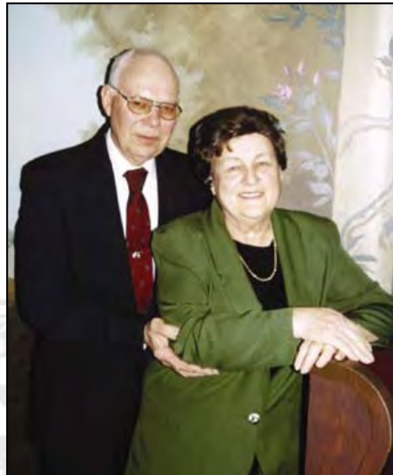
Harold and Lillian Gremel Michigan Dairy Memorial Endowed Scholarship