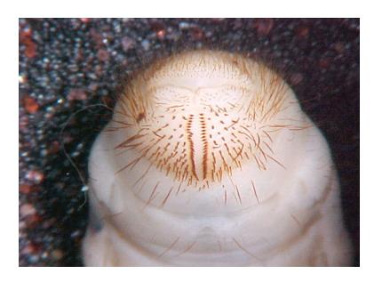
<u>June Beetles</u> have Y-shaped anal slits that are less clear than European Chafers and a parallel line palidium.