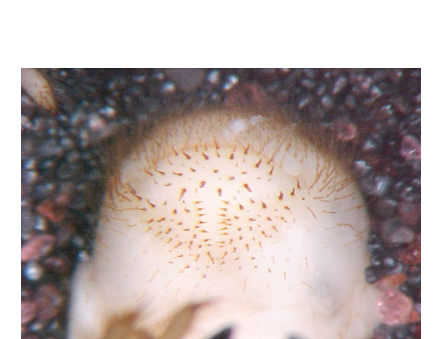
<u>False Japanese Beetles</u> have a U-shaped anal slit and a palidium shaped like a long, narrow V.