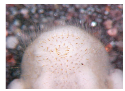
<u>Japanese Beetles</u> have a U-shaped anal slit and a palidium shaped like a short, wide V.

These by examining the raster of your grubs with a hand lens, you can tell these three types of grubs apart in the field.