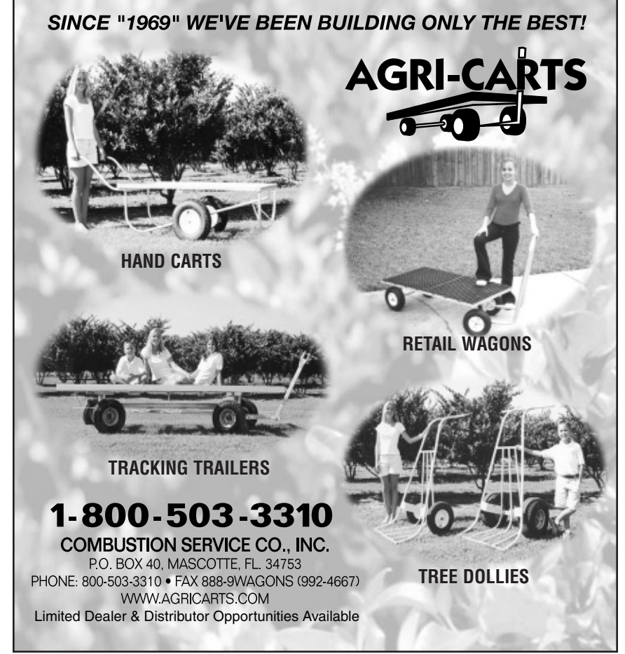
▲ Request 66 ▲

KATOLIGHT Corporation 100 Power Drive • Box 3229 Mankato, MN 56002-3229 (507) 625-7973 • FAX (507) 625-2968 800-325-5450 • www.katolight.com