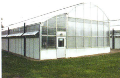
Insulating the north and side walls to bench height can save energy. Even though the savings is a small percentage of the total heating load, there is a good return on the investment.

Other options require an initial investment and then different future investments over the planned life. Some do not have any