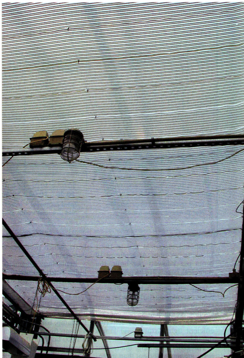
Energy curtains reduce heat loss by providing an additional insulation layer.

Using a good thermometer, do a temperature survey at many points throughout the production area. If there are significant variations, look for causes and means to reduce them. Variations can be caused by many fac-