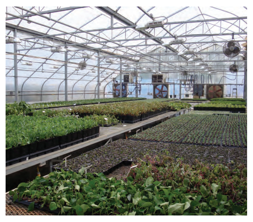
Figure 1. HPS fixtures and HAF fans are examples of acronyms commonly used in CEA.

PGR – Plant growth retardant or plant growth regulator; these are chemicals used to modify the growth habit. Growth retardants specifically inhibit the growth of internodes (distance