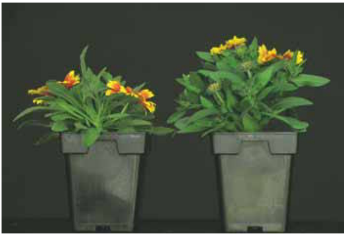
Figure 3. Gaillardia 'Gallo Dark Bicolor' forced under a nine-hour short day (left) or a 16-hour long day (right). Time to first flower was similar in the two treatments, but plants formed more flowers when forced under long days. Therefore, long days are beneficial for flowering of this and many other gaillardia.