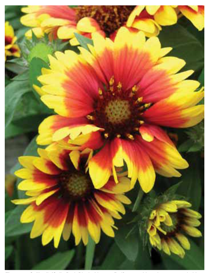
Figure 1. Gaillardia 'Gallo Dark Bicolor' is very floriferous with a nice compact habit.

Two factors that influence flowering in many (but not all) temperate herbaceous perennials are vernalization and photoperiod. Vernalization is defined as a cold treatment