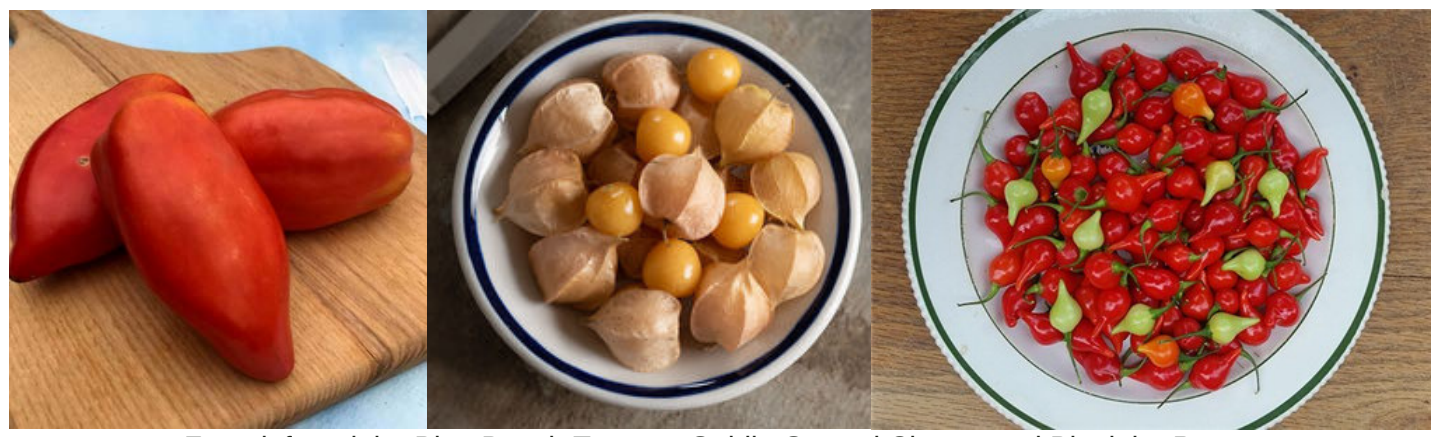
From left to right: Blue Beech Tomato, Goldie Ground Cherry, and Biquinho Pepper

This Cilantro (not pictured) is slow bolting and high yielding and this cilantro has darker leaves and reddish stems compared to other cultivars. It does, however, have the same delightful flavor for my salsa and pico de gallo.