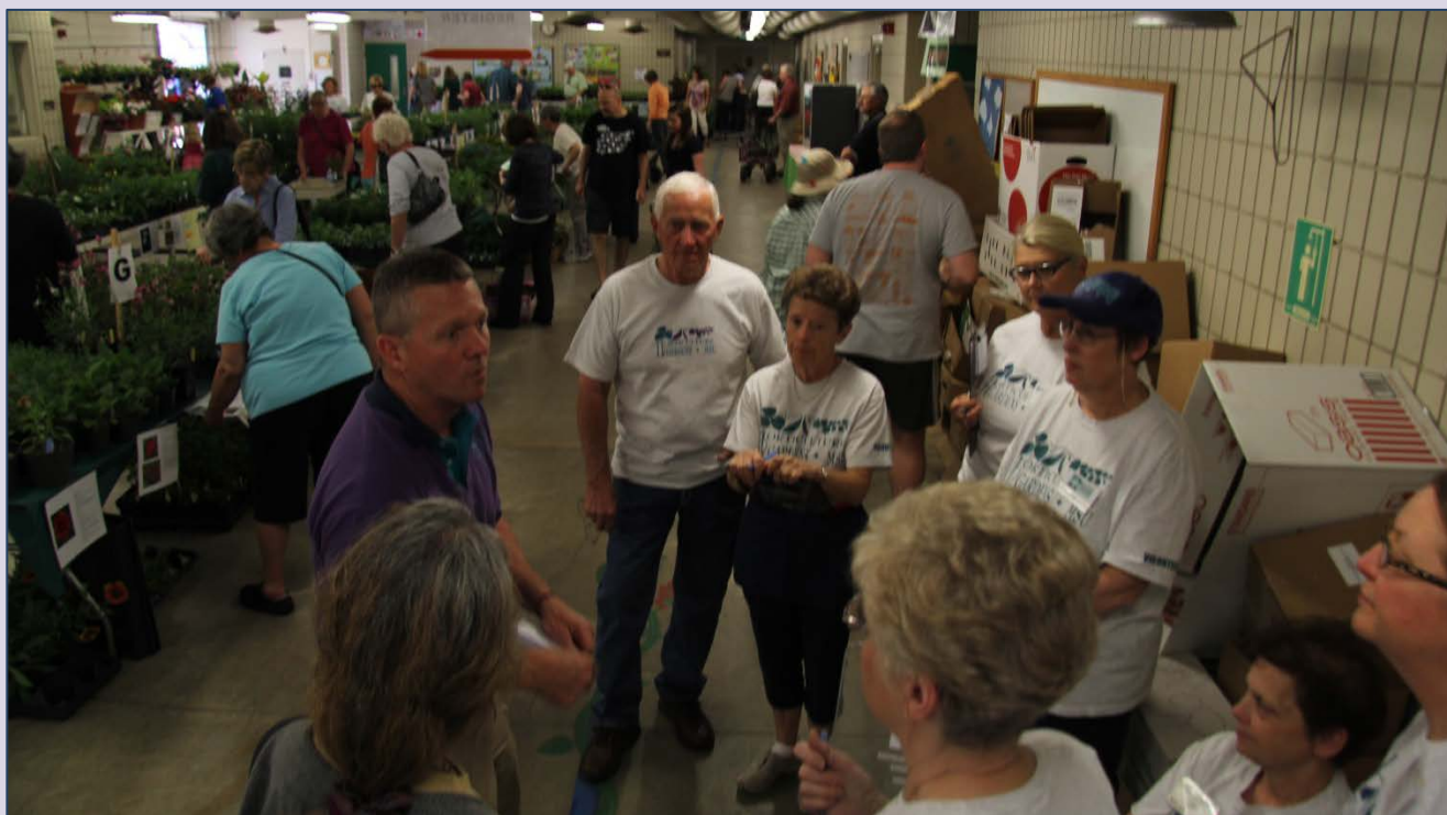
Our staff and volunteers work hard to make your shopping experience a happy one!

An added benefit for you, our Spring Sale this year is the same weekend as the East Lansing Art Festival, so it's a good excuse to combine a trip to both events and make a weekend of it ! For information, go to http://elartfest.com/