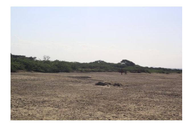
Figure 3. The Kerio River near to Nakurio, dry, with Prosopis juliflora growing along its bank in areas that previously comprised riverine gallery forest and farmland.

impossible amidst new forms of environmental volatility.