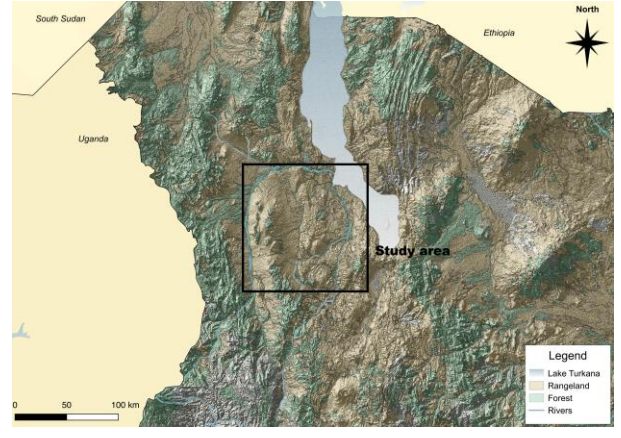
Figure 1. Topographic map of north-western Kenya showing the distribution of forest and rangeland and the rough parameters of the study area.

Its findings align with now prevalent arguments in the sphere of drylands development for new interventions and programmes to support ongoing adaptive strategies, and to work with uncertainty, rather than against it (i.e., Krätli and Schareika 2010; Krätli 2015; Scoones 2019).