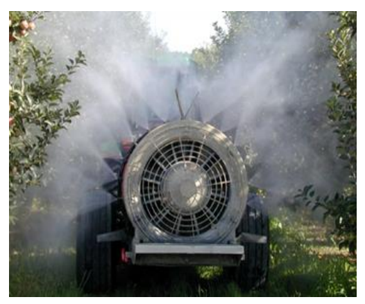
Fig. 7. Good coverage is essential to protecting cherries from SWD infestation. Expect to use high spray volumes, full cover applications, tight spray intervals, and returning with an application of another effective insecticide after a rainfall event.

Because SWD can complete a single generation in 8-10 days at 77°F, it is crucial to maintain excellent coverage with effective insecticides and alternate insecticides with different modes of