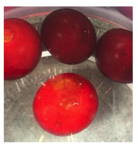
Fig. 5. SWD larva emerging from a lightly crushed cherry.