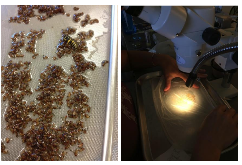
Fig. 3. Examples of SWD traps baited with yeast-sugar solution (left) or with a commercial lure suspended above a soapy water drowning solution (right).

The best homemade bait is a yeast-sugar mix, which ferments and attracts the flies. The mixture is made by combining 1 tablespoon of active dry yeast, 4 tablespoons of sugar, and 12 oz of water. If using the yeast-sugar bait, the solution needs to be changed at least weekly, and the fermented liquid should be disposed of away from the trapping area.