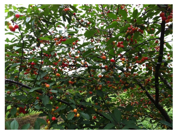
Fig. 6. Cherries are susceptible to SWD infestation as soon as they start turn from green to straw color and all the way through harvest.

Given the potential for rapid SWD population increase, ripening cherries require targeted management of adult flies to prevent fruit infestation from the time the fruit loses its green color until the end of harvest. Pesticide registrations and recommendations will change as we learn how to better manage this pest, and growers can remain informed through the MSU SWD website, local Extension Educators, and the MSU Extension News for Agriculture (www.msue.anr.msu.edu/topic/info/fruit).