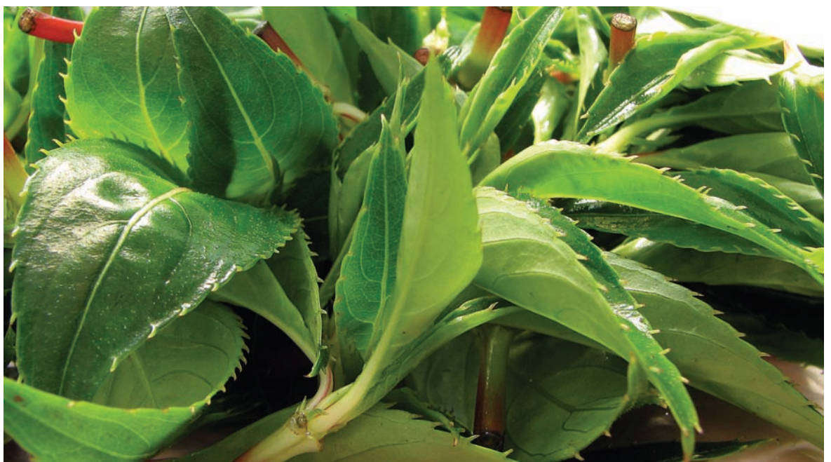
Pictured are good examples of high-quality New Guinea impatiens cuttings.

By Roland Leatherwood, Amy Enfield and Roberto Lopez