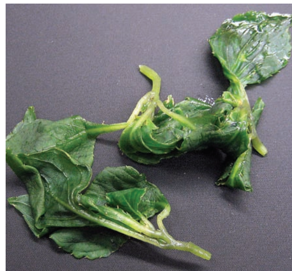
Top: These boxes contain newly arrived cuttings ready for sticking. Bottom: These New Guinea impatiens cuttings were damaged during transport.