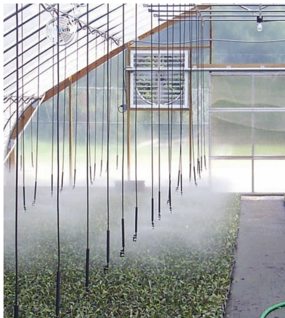
Hanging mist lines are a common method of irrigation in propagation.

Poor water quality can damage cuttings. Electrical conductivity, pH and hardness should