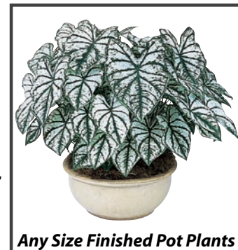
Any Size Finished Pot Plants

We also feature a complete selection of finished and prefinished Caladium plants.