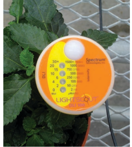
Figure 3. The Light Scout is a small, mobile sensor without data logging capabilities.

DLI is a very important measurement for greenhouse growers because it influences plant growth, development, yield and