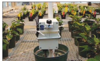
Figure 2. Light quantum sensors connected to a computer can measure and record instantaneous light levels throughout the day.

The footcandle and lux are the most common units used to measure instantaneous light in the United States and other