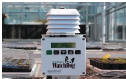
Figure 4. WatchDog weather stations contain a light sensor and automatically calculate DLI.

sticking until rooting initiation/callusing – then increasing DLI between 6 to 8 mol.m -2 .d -1 – will promote rooting and enhance shoot and root biomass accumulation (Figure 1). Providing an optimum DLI during propagation can decrease propagation time, enhance rooting and compactness to facilitate shipping and transplant, and reduce subsequent time to flower.