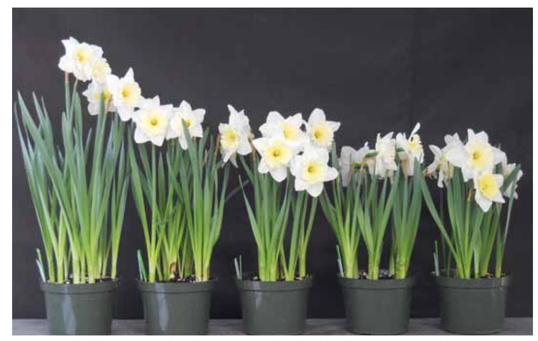
Figure 3. The effects of a Florel drench on 'Ice Follies' daffodils at full flower. Eighteen cold weeks, in the greenhouse on March 6. Left to right: Control, 100-, 200-, 300-, or 500-ppm Florel drench (4 ounces per 6-inch pot) applied at the 2- to 4-inch leaf stage.