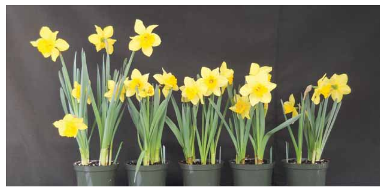
Figure 2. The effects of a Florel drench on 'Carlton' daffodils at full flower. Eighteen cold weeks in the greenhouse of March 6. Left to right: Control, 100-, 200-, 300-, or 500-ppm Florel drench (4 ounces per 6-inch pot) applied at the 2- to 4-inch leaf stage.

Ethylene is released from the substrate over many days, and the speed of release varies within the pH range of soil-less mixes (5.4 to 6.2). Florel substrate drenches can perhaps be thought of as a "slow release" ethylene treatment system. Substrates at a low pH have a longer but slower release