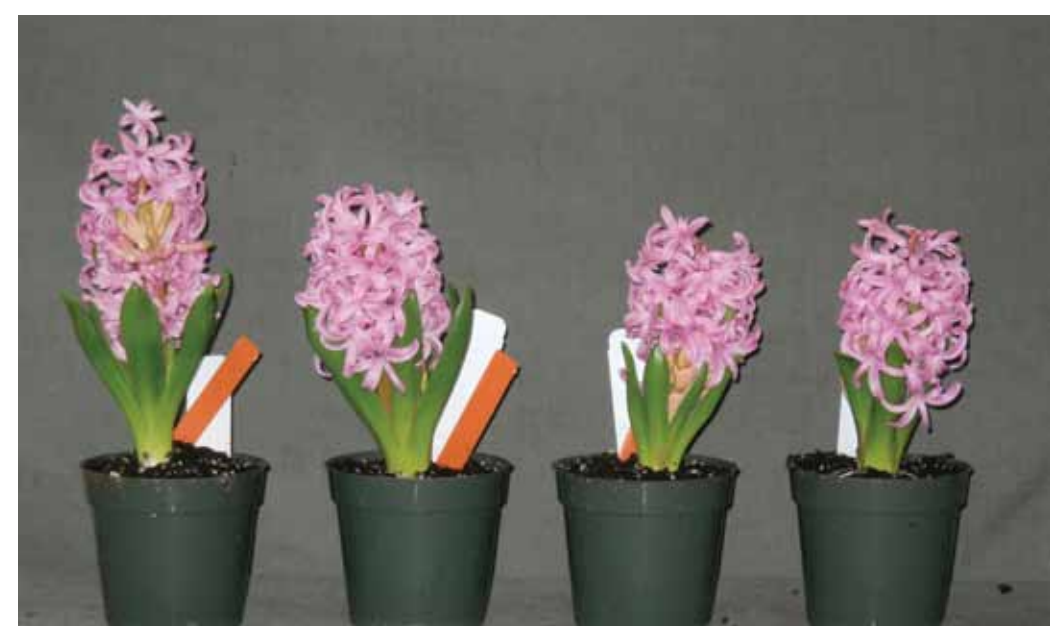
Figure 5. The effects of a Florel drench on 'Pink Pearl' hyacinths at full flower. Seventeen cold weeks in the greenhouse on March 8. Left to right: Control, 200-, 350-, or 500-ppm Florel (2 ounces per 4-inch pot) applied three to four days before the first flower opened.

of application was the same as for a normal Florel spray: when daffodil leaves were about 3 to 4 inches tall, and for hyacinths three to four days before the lowest flower opened. Results are summarized below.