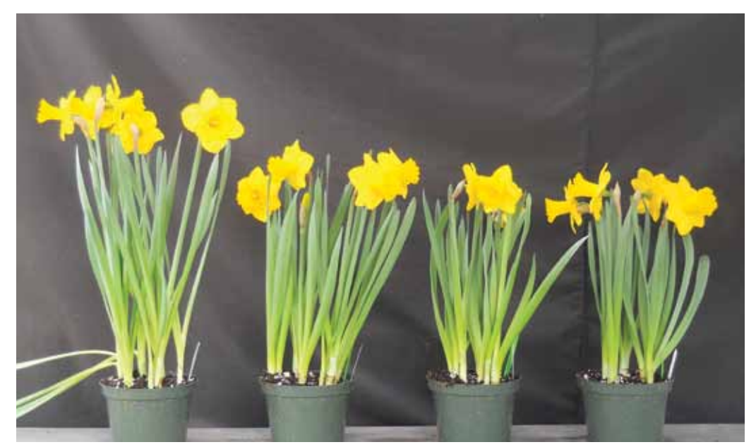
Figure 4. The effects of a Florel drench on 'Primeur' daffodils at full flower. Seventeen cold weeks in the greenhouse on Jan. 31. Left to right: Control (no Florel) or 250 ppm applied (4 ounces per 6-inch pot) one, six or nine days after transferring plants into the greenhouse.